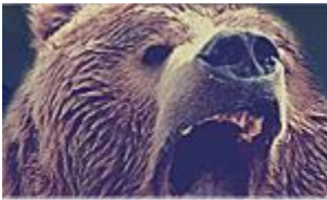
Fast Facts About North America That You Never