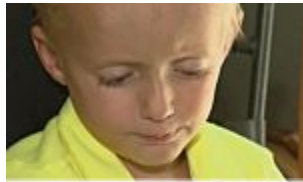
Snail hatches in boy's knee